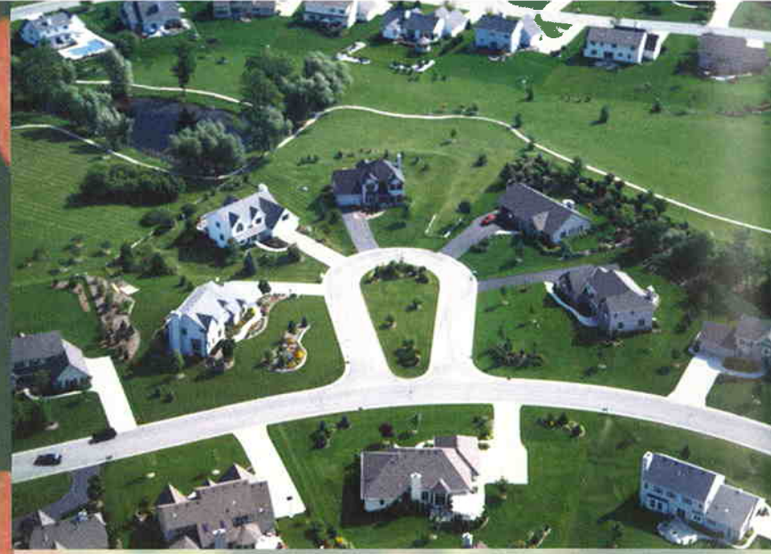
Example of a Siepmann open space concept; Windsong Community, Germantown

The Ever-changing Colors of Nature's Palette ...Yours to Call Home